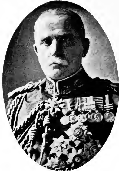
FIELD MARCHALL SIR JOHN FRENCH

The European War. —The battle of the Aisne continued practically every day until the siege of Antwerp, on September 26, and even then continued along the lines at different times until after the 17th of October, the date of this record. The net results of these engagements cannot be stated at present. About the only thing that is certain is that the Germans retired eastward even as the Allies, during the month previous, had retired towards Paris. The Germans called their falling back, "a strategical retreat," by which they meant to concentrate their forces, shorten their lines of communication with their base of supplies, and secure a more defensible position. It will be remembered that the Allies called their retirement from the Belgian border by the same name, and it appears that the justification in both cases is not without reason. Neither party gave ground until they were compelled to, and both retreated in such good order that the armies were kept intact. Many battles as big as the battle of Waterloo occurred between the four million soldiers that were in the lines, and neither army either met with a decisive defeat nor with a decisive victory.